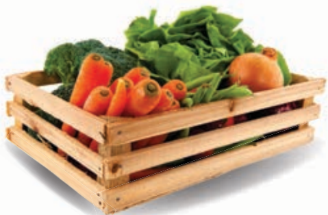
CUT VEGETABLES (SELECTION, WASHING, CUTTING, DRYING)