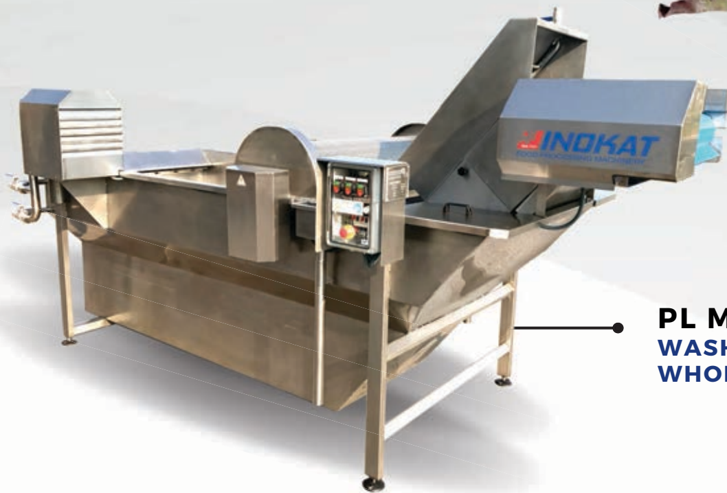
PL MODEL 3500 WASHING ELEVATOR FOR WHOLE VEGETABLES